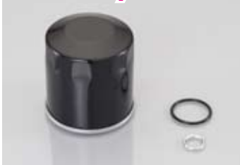
Full set that includes everything you need for oil exchange.