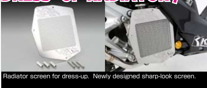
Radiator screen for dress-up. Newly designed sharp-look screen.