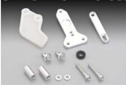
Chain guard is a must to meet race regulations. Protects your leg from chain & sprocket when falling down.