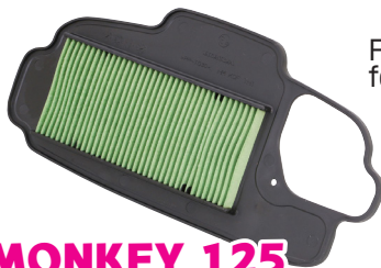
Replacement air element for stock air cleaner.

REPLACEMENT AIR ELEMENT! 2 ELEMENT NEWLY RELEASED !!