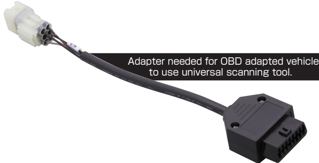
Adapter needed for OBD adapted vehicle to use universal scanning tool.

FOR UNIVERSAL SCANNING TOOL! OBD ADAPTER FOR KTM NEWLY RELEASED!!