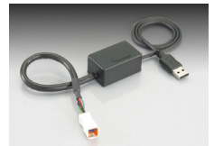
PC INTERFACE CABLE

REV LIMIT : 10,000 rpm ※ It is not to guarantee that the vehicle revs up till rev limit. ※ 1, PC INTERFACE CABLE (763-0500900) PC with WINDOWS required to make original map. Setting software is downloadable from Kitaco website (kitaco.co.jp).