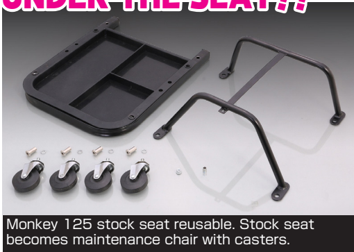
MONKEY 125 STOCK SEAT (IMAGE)

Monkey 125 stock seat reusable. Stock seat becomes maintenance chair with casters.