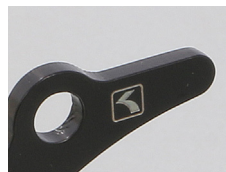
"K" is razor marked on the plate.