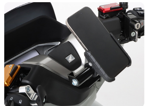
MOBILE HOLDER MOUNTING IMAGE