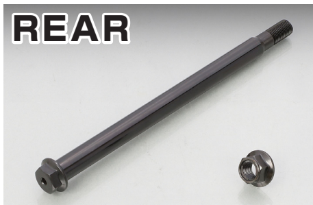
Hollow axleshaft to reduce load under spring.