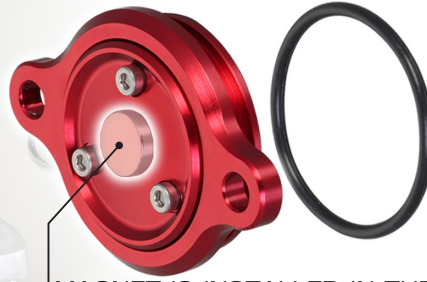
MAGNET IS INSTALLED IN THE FILTER COVER (REMOVABLE)