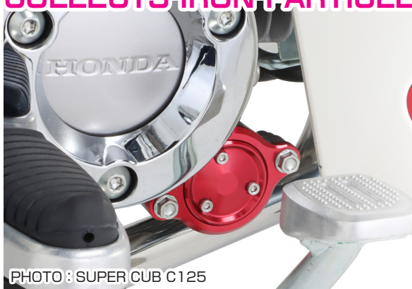
PHOTO : SUPER CUB C125