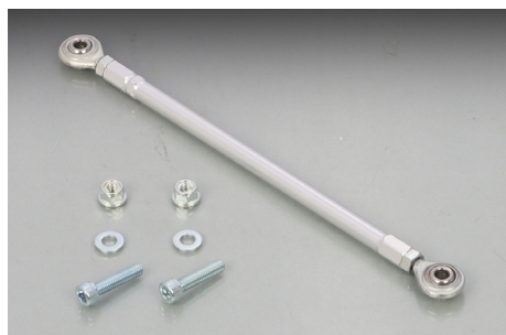
STOCK PULL ROD