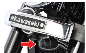
MITSUBA DRIVE RECORDER CAMERA