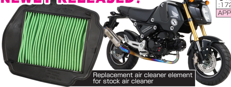
Replacement air cleaner element for stock air cleaner