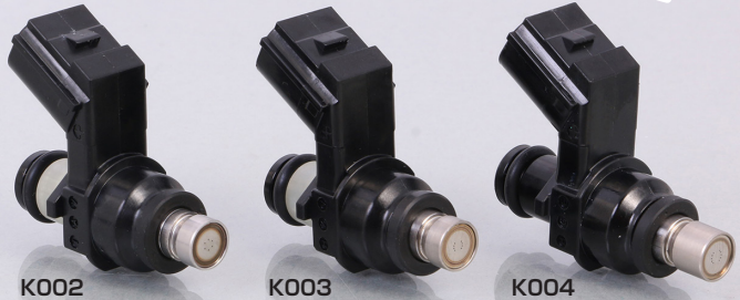
Big capacity injectors for tuning engines. 3 different type released according to your tuning levels.